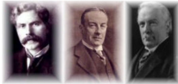
Ramsay MacDonald, Stanley Baldwin, David Lloyd George

On 30th May 1929 the UK General Election took place, and with no clear winner, there was a hung parliament. Ramsay MacDonald's Labour Party won the most seats, but failed to get a majority. The Liberals, led by Lloyd George regained some seats lost in 1924, and held the balance of power. Rather than concede to this situation, the Conservatives stood down, and shortly afterwards, Ramsay Macdonald formed a new Labour Government, and appointed the first ever female cabinet minister, Margaret Bondfield.